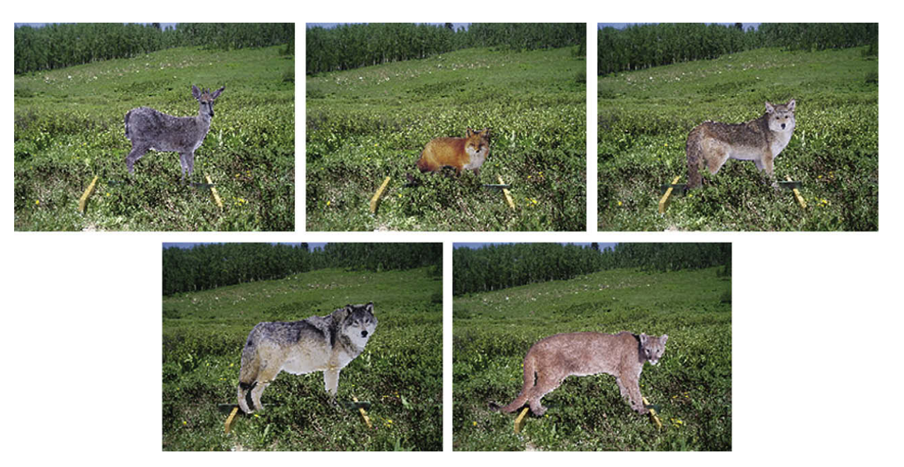
Figure 1. Photographs of the life-size stimuli presented to yellow-bellied marmots to study predator discrimination abilities. All stimuli were photographed at the same distance so that relative size was maintained.

D.T. Blumstein et al. / Animal Behaviour xxx (2009) 1-6