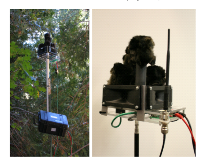
Figure 1: Left: Acoustic ENSBOX, the embedded device we used for our experiments. Right: close-up of the microphone array.

For our experiments we have developed a network of Acoustic Embedded Networked Sensing Boxes (Acoustic ENSBox) as a prototype for wildlife monitoring system [5, 6, 7]. Each system is a small embedded computer running Linux, self-contained in a waterproof case, with an external four microphone array and 802.11b wireless communication (Figure 1). In com-