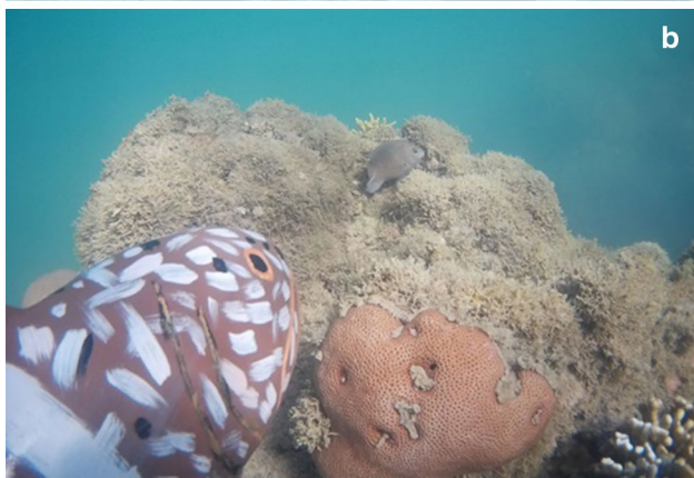
Fig. 1 Predator model used to stimulate flight of Stegastes fuscus (a). The moment that an individual S. fuscus began to flee (b)

complexity, using Luckhurst and Luckhurst's (1978) chain method, where a chain was placed on the substrate in such a way as to follow as closely as possible all the contours and crevices. This generated a measure of the surface that we expressed in relation to the linear distance (Luckhurst and Luckhurst 1978). The RI was calculated using the formula RI = linear/surface, in which "linear" means the measure of when the chain was stretched (1 m) and "surface" is the distance between the beginning and end of the chain when it is adjusted to all the contours and crevices. Three measurements of rugosity were made within all territories of the chosen fish (i.e., 270 measurements in total). We used the average of these three values as our measure of rugosity.