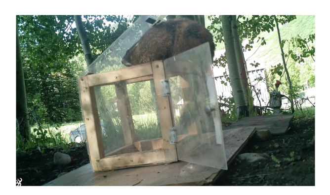
Figure 1. The two-action puzzle box with plywood and camera trap set-up. Marmots could solve the box by opening the lid or opening the door. Either solution could remain open after first production.