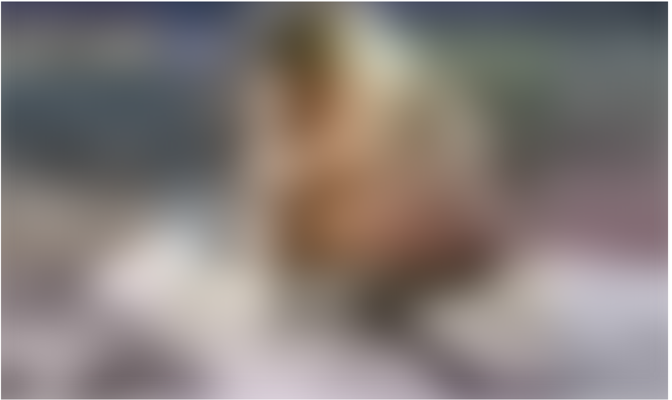
Yellow-bellied marmot

The scientists did so in a group of 73 female yellow-bellied marmots , a group of medium-sized rodents that hibernate for up to eight months per year. They used only females because the precise age of males is hard to ascertain as they tend to immigrate from elsewhere. The researchers collected samples every two weeks, for a total of 149 workable samples that were analyzed.