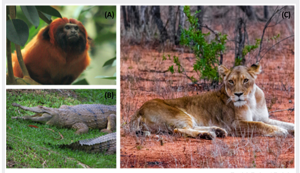
Trends in Ecology & Evolution

In combination with husbandry practices, use of behavioural techniques, including hazing, has reduced livestock losses and retaliatory killing of lions ( Panthera leo ) in Southern Africa (Figure IC) [54]. Within each pride, at least one lion is fitted with a GPS collar and early warning messages are sent to local communities if the animals approach areas with livestock. Volunteers then chase the lions using horns to move them away. This technique has been shown to be particularly successful when the aversive events are repeated regularly and before animals have developed problematic behaviours [8].